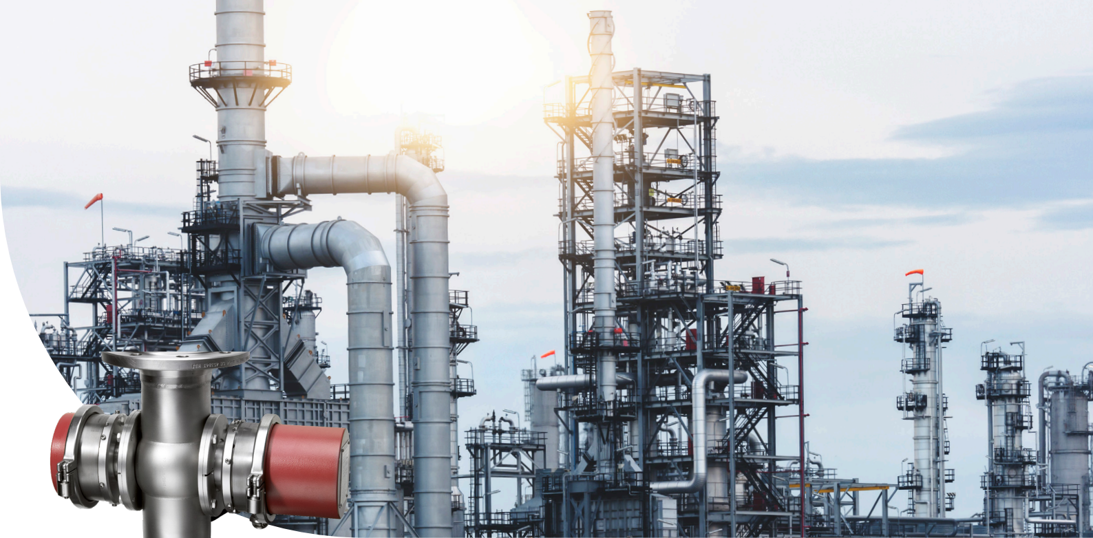
The Color Plus Ex